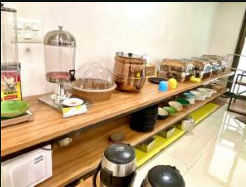
ATTENTION TO DETAIL, HYGIENE & TASTE.