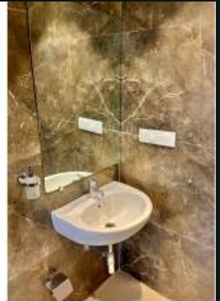
ATTACHED WASHROOMS IN ALL ROOMS