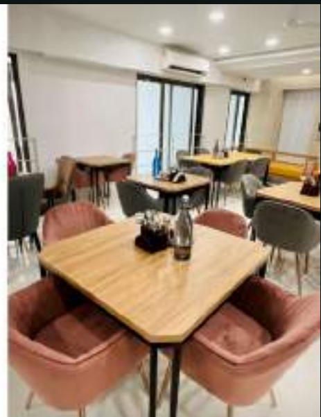
DINING AREA FOR INDIAN & CONTINENTAL FOOD