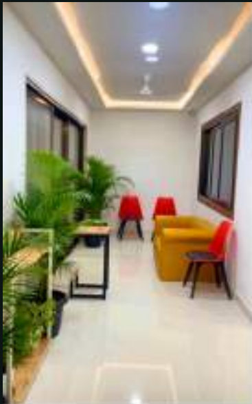
CHILL ZONES ON EVERY FLOOR