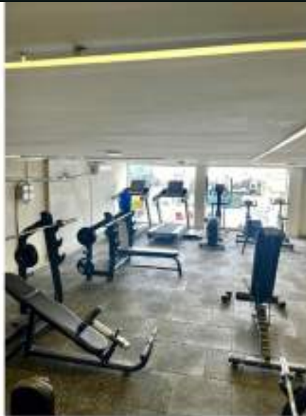
ROOFTOP GYM WITH TRAINER